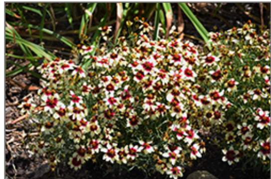
Sizzle And Spice Red Hot Vanilla Tickseed in bloom