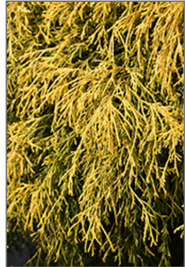
Paul's Gold Threadleaf Falsecypress foliage

Paul's Gold Threadleaf Falsecypress is recommended for the following landscape applications;