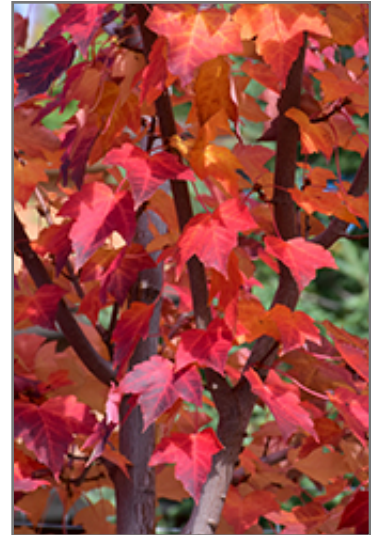
Prairie Rouge Red Maple in fall