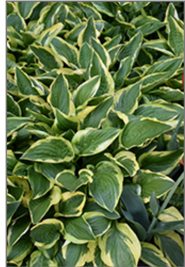
Hertha Hosta foliage