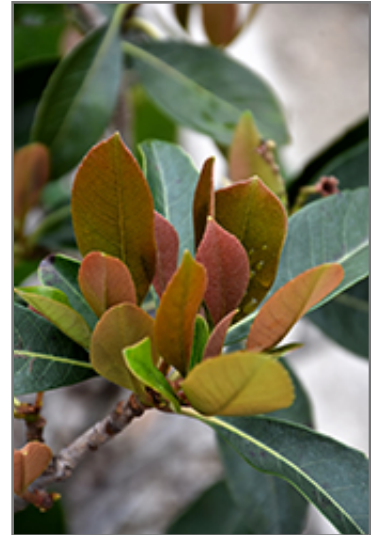
Coppertone Loquat foliage

This plant is not reliably hardy in our region, and certain restrictions may apply; contact the store for more information.