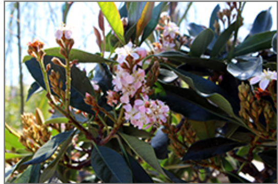
Coppertone Loquat flowers

Coppertone Loquat is clothed in stunning panicles of fragrant pink star-shaped flowers with tan eyes at the ends of the branches from mid to late fall. It has attractive dark green foliage with grayish green undersides which emerges coppery-bronze in spring. The glossy oval leaves are highly ornamental and remain dark green throughout the winter. The fruits are showy yellow pomes carried in abundance from early to late winter. The fruit can be messy if allowed to drop on the lawn or walkways, and may require occasional clean-up. The smooth gray bark adds an interesting dimension to the landscape.