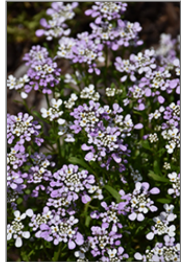
Lavish Candytuft flowers