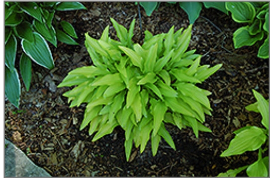
Bitsy Gold Hosta

Bitsy Gold Hosta is recommended for the following landscape applications;