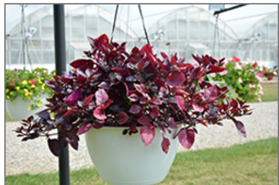
Brazilian Joy Weed