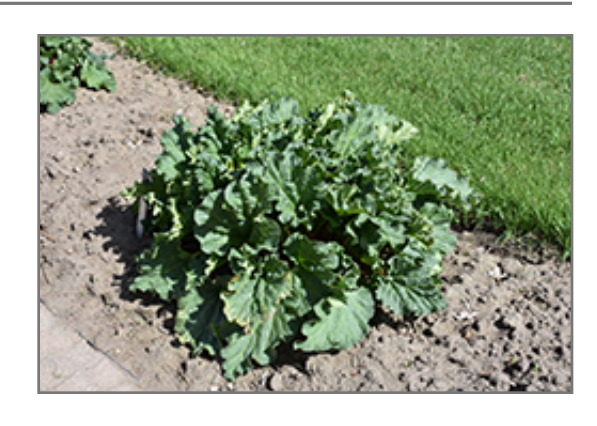
Glaskin's Perpetual Rhubarb

This is an herbaceous perennial with a rigidly upright and towering form. Its wonderfully bold, coarse texture can be very effective in a balanced garden composition. This plant will require occasional maintenance and upkeep, and can be pruned at anytime. Deer don't particularly care for this plant and will usually leave it alone in favor of tastier treats. It has no significant negative characteristics.