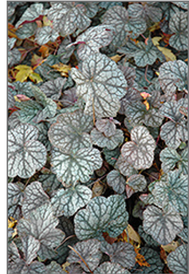
Pewter Veil Coral Bells foliage

Pewter Veil Coral Bells is recommended for the following landscape applications;