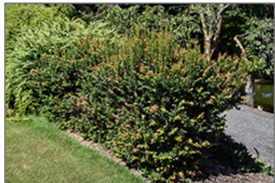
Thunderbird Evergreen Huckleberry