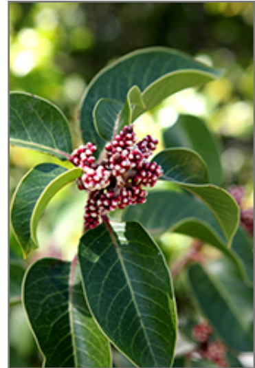
Sugar Bush flower buds