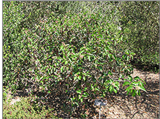
Sugar Bush

Sugar Bush will grow to be about 10 feet tall at maturity, with a spread of 10 feet. It tends to be a little leggy, with a typical clearance of 4 feet from the ground, and is suitable for planting under power lines. It grows at a medium rate, and under ideal conditions can be expected to live for approximately 30 years.