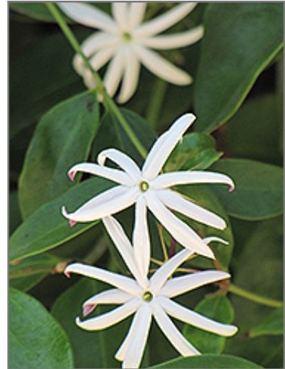
Angel Wing Jasmine flowers