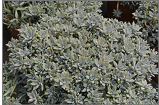
Ghost Plant

Ghost Plant is recommended for the following landscape applications;