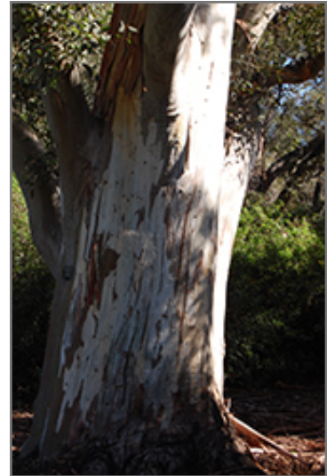
Mountain Gum bark

This plant is not reliably hardy in our region, and certain restrictions may apply; contact the store for more information.