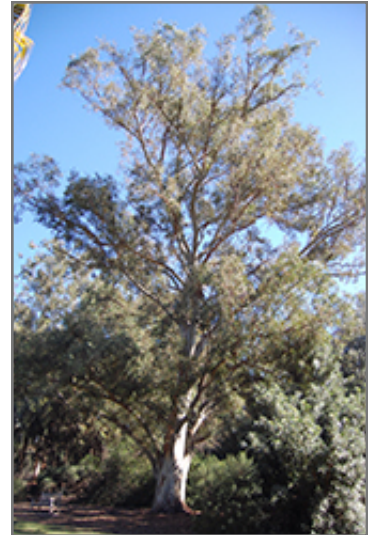
Mountain Gum