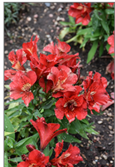
Colorita Kate Alstroemeria flowers