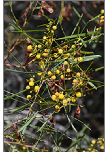
Shoestring Acacia flowers