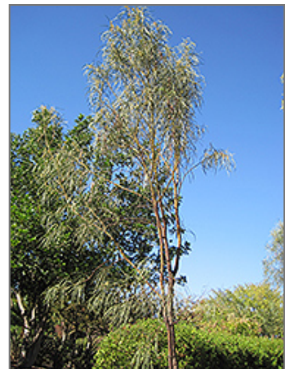
Shoestring Acacia