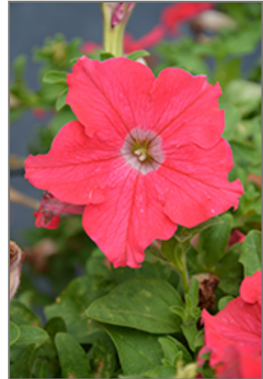
Panache Coral Reef Petunia flowers