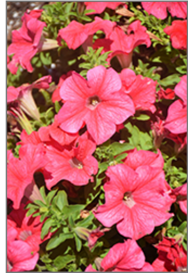
Panache Coral Reef Petunia flowers

Panache Coral Reef Petunia is a fine choice for the garden, but it is also a good selection for planting in outdoor containers and hanging baskets. It is often used as a 'filler' in the 'spiller-thriller-filler' container combination, providing a mass of flowers against which the thriller plants stand out. Note that when growing plants in outdoor containers and baskets, they may require more frequent waterings than they would in the yard or garden.