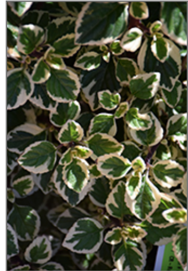
Candy Kisses Wild Sage foliage

Candy Kisses Wild Sage is recommended for the following landscape applications;