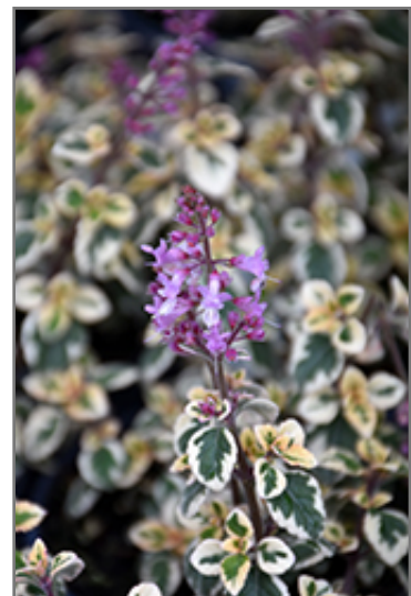
Candy Kisses Wild Sage flowers