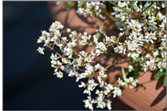
Bling White Princess Euphorbia flowers

Bling White Princess Euphorbia will grow to be about 12 inches tall at maturity, with a spread of 24 inches. Its foliage tends to remain dense right to the ground, not requiring facer plants in front. This fast-growing annual will normally live for one full growing season, needing replacement the following year.