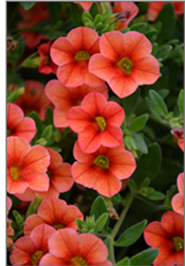
Catwalk Mandarin Glow Calibrachoa flowers

This plant will require occasional maintenance and upkeep. Trim off the flower heads after they fade and die to encourage more blooms late into the season. It is a good choice for attracting bees and hummingbirds to your yard, but is not particularly attractive to deer who tend to leave it alone in favor of tastier treats. It has no significant negative characteristics.