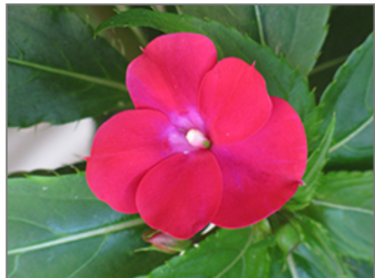
Infinity Cherry Red New Guinea Impatiens flowers