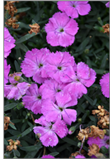
Paint The Town Fuchsia Pinks flowers

Paint The Town Fuchsia Pinks is recommended for the following landscape applications;