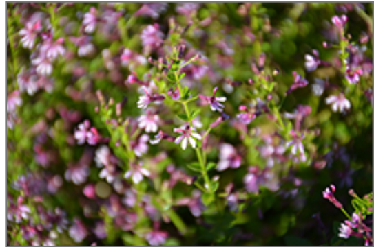
Fairy Dust Pink Cuphea flowers

Fairy Dust Pink Cuphea is recommended for the following landscape applications;