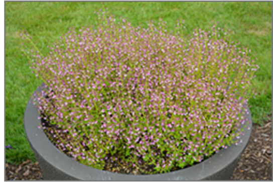
Fairy Dust Pink Cuphea in bloom

Fairy Dust Pink Cuphea will grow to be about 12 inches tall at maturity extending to 16 inches tall with the flowers, with a spread of 15 inches. When grown in masses or used as a bedding plant, individual plants should be spaced approximately 10 inches apart. Its foliage tends to remain dense right to the ground, not requiring facer plants in front. Although it's not a true annual, this plant can be expected to behave as an annual in our climate if left outdoors over the winter, usually needing replacement the following year. As such, gardeners should take into consideration that it will perform differently than it would in its native habitat.