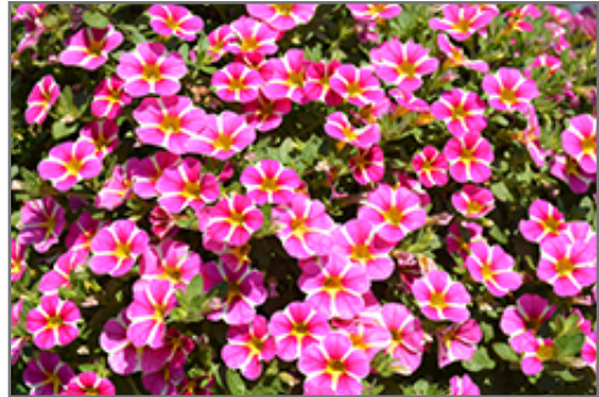
Superbells Rising Star Calibrachoa flowers

This plant will require occasional maintenance and upkeep. Trim off the flower heads after they fade and die to encourage more blooms late into the season. It is a good choice for attracting bees and hummingbirds to your yard, but is not particularly attractive to deer who tend to leave it alone in favor of tastier treats. It has no significant negative characteristics.