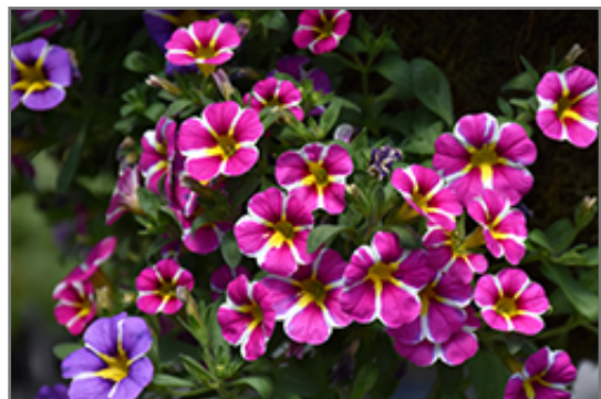
Superbells Rising Star Calibrachoa flowers