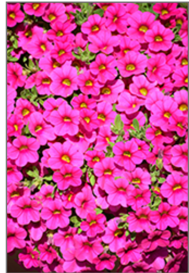
Million Bells Compact Brilliant Pink Calibrachoa flowers

This plant will require occasional maintenance and upkeep. Trim off the flower heads after they fade and die to encourage more blooms late into the season. It is a good choice for attracting bees and hummingbirds to your yard, but is not particularly attractive to deer who tend to leave it alone in favor of tastier treats. It has no significant negative characteristics.