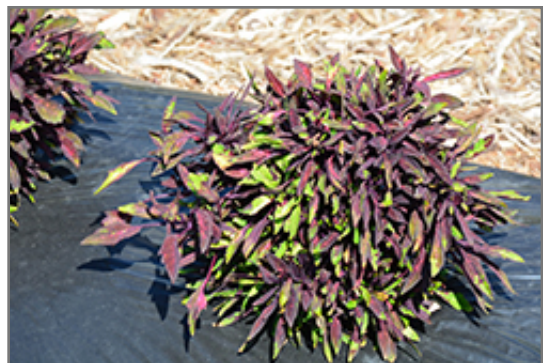
Fancy Feathers Black Coleus