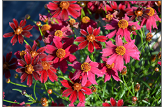
Bloomsation Dragon Tickseed flowers