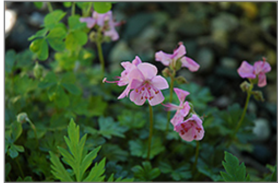
Claridge Druce Cranesbill flowers

Claridge Druce Cranesbill is recommended for the following landscape applications;