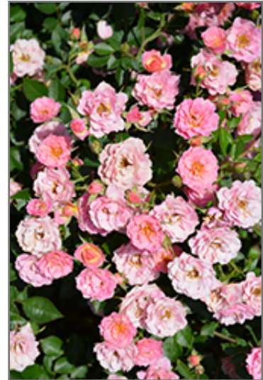
Oso Easy Petit Pink flowers