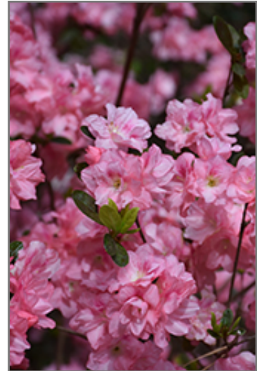
Sweetheart Supreme Azalea flowers