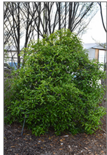
Apricot Gold Fragrant Tea Olive