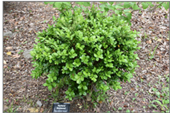
Richard Harland Boxwood