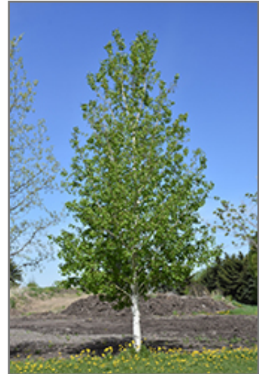
Pike Bay Quaking Aspen