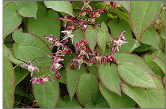
Bishop's Hat flowers