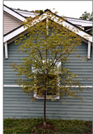
Cinnamon Girl Paperbark Maple in fall