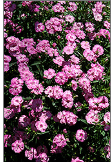
Blue Hills Pinks flowers

Blue Hills Pinks is recommended for the following landscape applications;