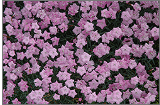
Bath's Pink Pinks in bloom