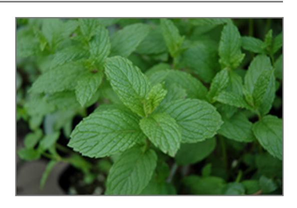
The Best Spearmint foliage

Aside from its primary use as an edible, The Best Spearmint is sutiable for the following landscape applications;