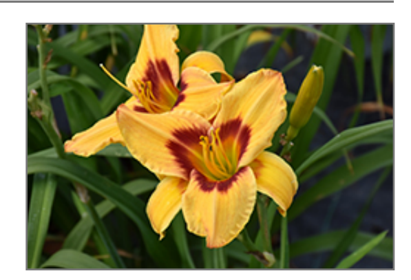
Rainbow Rhythm Tiger Swirl Daylily flowers

Rainbow Rhythm Tiger Swirl Daylily features bold yellow trumpet-shaped flowers with gold overtones, chartreuse throats and a red ring at the ends of the stems in mid summer. The flowers are excellent for cutting. Its grassy leaves remain green in color throughout the season.