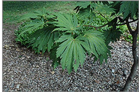
Yama Kagi Fullmoon Maple foliage