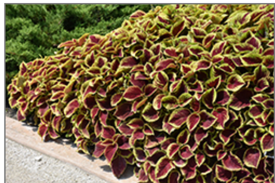
Crimson Gold Coleus