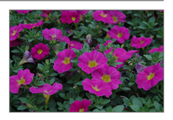
SuperCal Grape Petchoa flowers