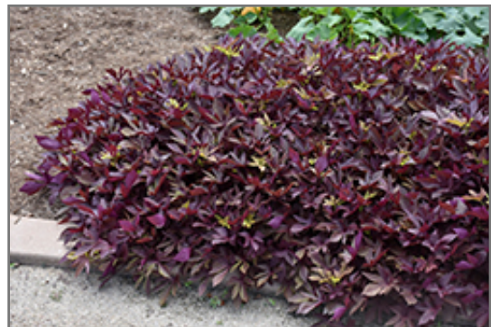
SolarPower Red Sweet Potato Vine