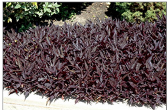
SolarPower Black Sweet Potato Vine