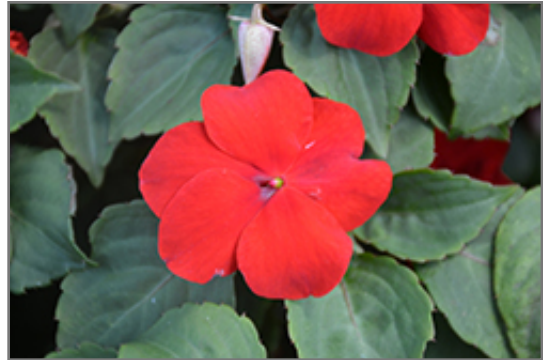
Lollipop Cherry Red Impatiens flowers