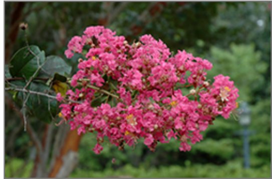
Watermelon Red Crapemyrtle flowers