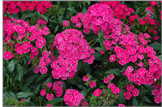
Jolt Pink Hybrid Pinks flowers

Jolt Pink Hybrid Pinks is recommended for the following landscape applications;