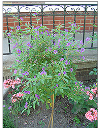
Blue Potato Bush (tree form) in bloom