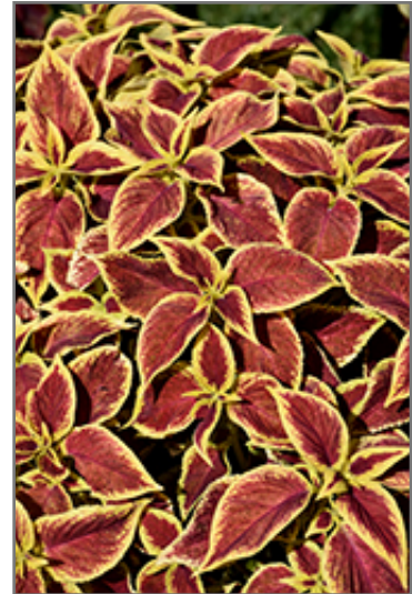
Premium Sun Crimson Gold Coleus foliage

Premium Sun Crimson Gold Coleus is recommended for the following landscape applications;